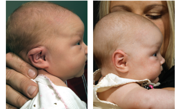
Before and After photographs provide "proof positive" that the transformative therapy of the EarWell™ auricular corrective system truly works.

Some ears do improve over time, some require surgery after the age of four or five, and some children are forced to live with their defect. Unfortunately, no physician can predict which ears will improve naturally, which ears will remain the same, and which ears will worsen. Fortunately, through EarWell™'s transformative therapy, you will never have to risk your child's future physical and emotional well-being.