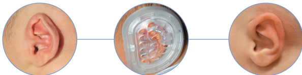
Before EarWell™ During EarWell™ therapy After EarWell™

The EarWell™ procedure is completed in just minutes, right in your doctor's office. After 4-6 weeks, the ears will be shaped normally.